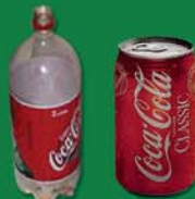
Soda bottles & cans