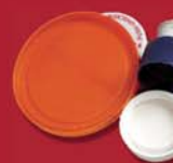
Lids, caps, tops