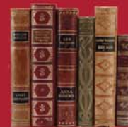
Hard back books