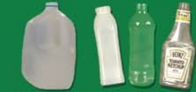
Plastic bottles & jugs ONLY : Check for the neck!