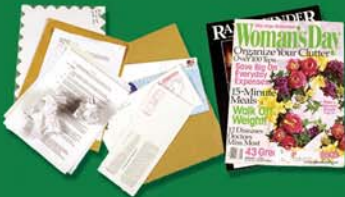
Junk mail, magazines, mixed paper and catalogs