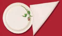
Paper plates & napkins