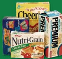
Cereal and cracker boxes