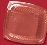
Plastic food boxes or trays