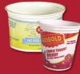
Yogurt, dairy tubs