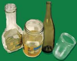
Glass bottles and jars