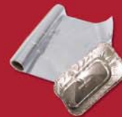
Aluminum foil & trays