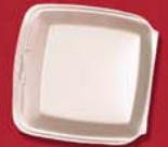
Foam take-out containers