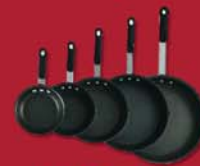
Pots & pans