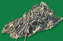
Grass, leaves, brush, mulch